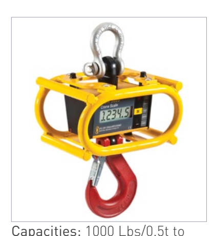
25,000Lbs/12.5t With optional protective cage