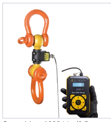
Capacities: 1000 Lbs/0.5t to 600,000Lbs/300t Cable length 16 ft.