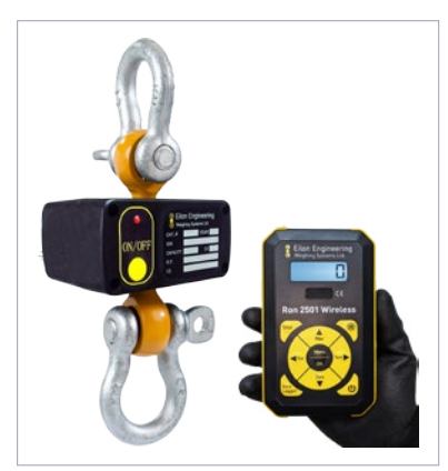
Capacities: 1000 Lbs/0.5t to 600,000Lbs/300t Transmission range: 150 yards / meters (Outdoor, line of sight)