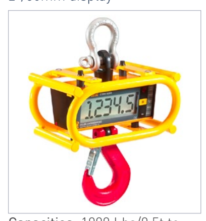
Capacities: 1000 Lbs/0.5t to 30,000Lbs/15t With optional protective cage